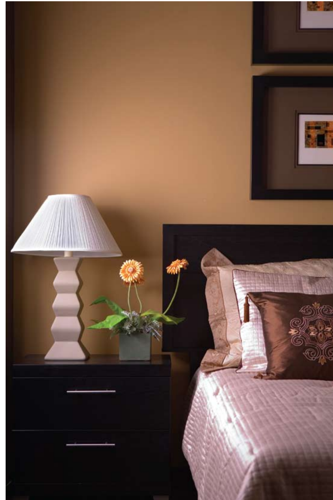
DEVELOPER'S CONCEPTUAL RENDERING. FEATURES AND AMINITIES PROPOSED AND SUBJECT TO CHANGE.